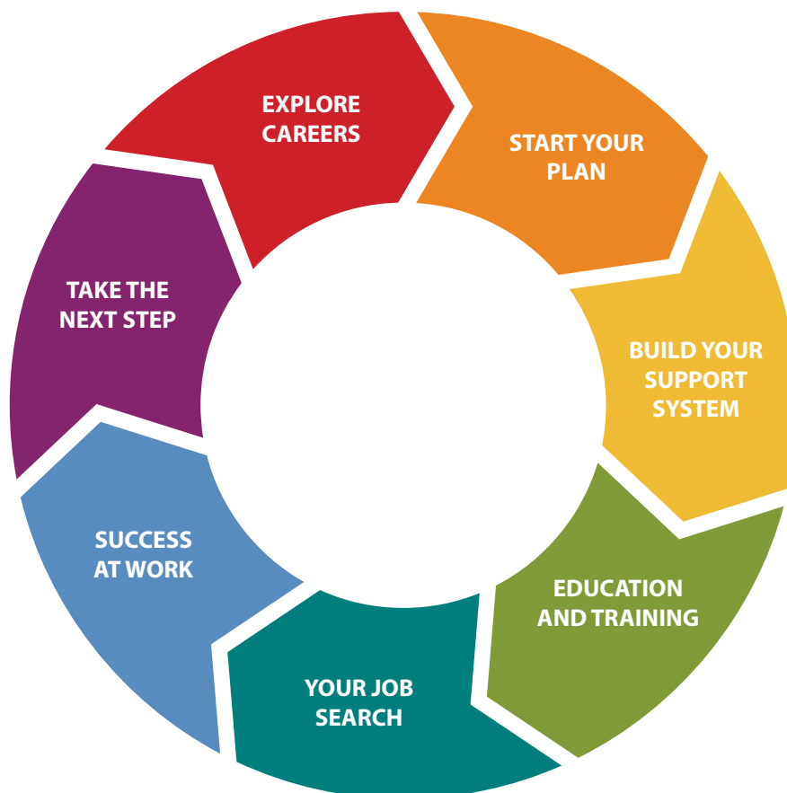
Career Planning and Development

Reaching your career goals involves many phases and can be viewed as a cycle rather than a straight path. The chapters of this guide are based on the cycle shown below. If you want to make a career decision, start by exploring careers that interest you. At any time in your life, you may find yourself at a different point in the cycle, so you can go straight to that section of the guide.