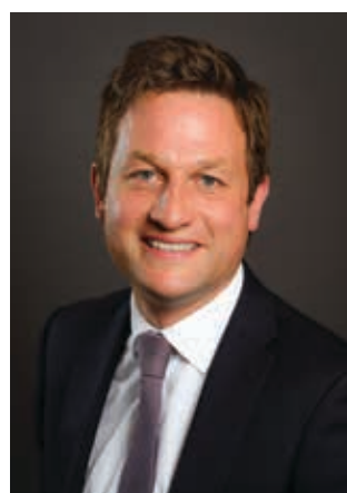
Honourable Rob Fleming Minister of Education